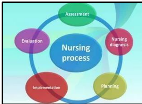
Figure 2: Collaborating nursing process (Source: Influenced by 16)

The teams in the healthcare department face some challenges related to managing the team such as conflicts in the management of the team, different decision-making of the team members, reflecting the progress, difficulty in teaching their members with different mentality and efficiency and many others. These challenges are similar for both the administrative team and clinical team in the healthcare sector [16]. The collaborative nursing process is unique and helps to resolve all the challenges regarding the management of the team. The protocols that are taken in the collaborative process are smarter and more efficient enough to maintain all the team members of the healthcare sectors. The healthcare segment of the whole world is projected to reach up to US$ 52.65 bn in 2022 and the revenue of the market value of healthcare is projected to reach up to US$ 94.07 bn by 2027 [17].