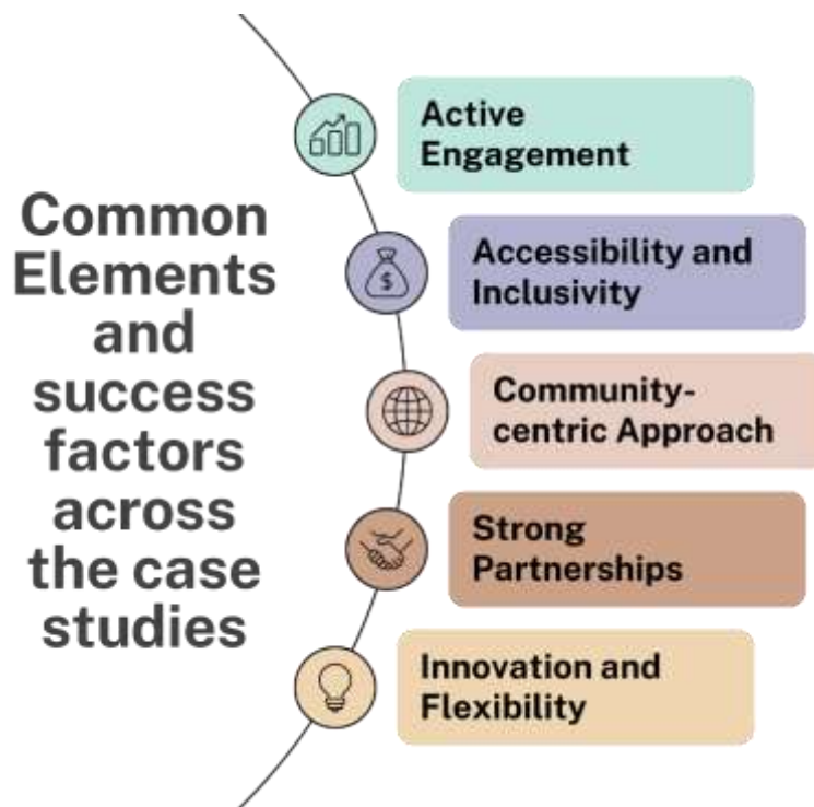
Figure 2: Common elements and success factors across the case studies