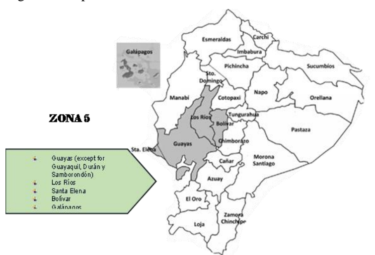
Figure 1. Map of Ecuador's Zone 5