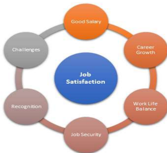
Figure 1: Factors of Job Satisfaction