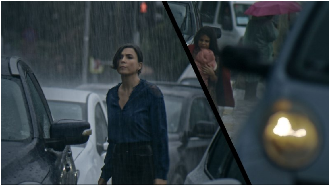
Figure 2 The scene from the Guest ( Misafir , 2017): Lena searches for help in heavy rain for her sick baby sister, while the bourgeois benefactor notices them and decides to help them

her seemingly secure privileged position in the social relations. This is why she asks to her partner what he would do on the last day before some war breaks out here in Turkey.