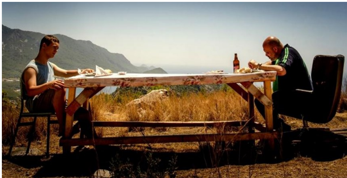
Figure 4 Ahlat the father and Gaza the son with hilltop view