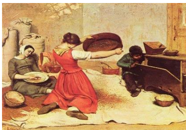
Figure 2: John Francois Millet's Grain Threshers. [Link to John Francois Millet's Grain Threshers]( https://alwasat.ly/news/art-culture/311277 )

Jean-François Millet, a French painter and one of the founders of the Barbizon School. He classified his work as part of the realist art movement. Figure (2).