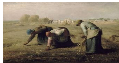
Figure 1: Gustave Courbet's Wheat Stack Paintings. [Link to Gustave Courbet's Wheat Stack Paintings]( https://www.google.com/search? )