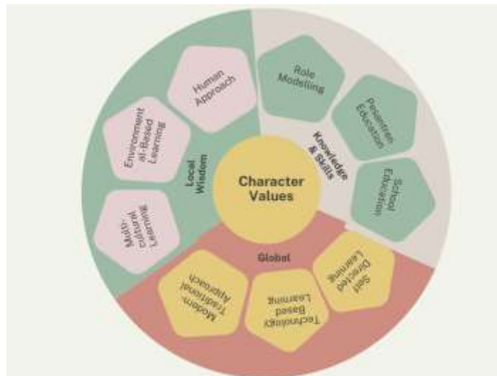
Figure 3. Model of Pesantren Education Transformation

From the results of data findings and analysis of Islamic boarding school education in Indonesia, the researchers then proposed a transformation model for Islamic boarding school education that combines three aspects, namely local wisdom, knowledge and skills, and global (Figure 3). The essence of Islamic boarding school education remains the main goal in this transformation, namely building character values such as politeness, mutual respect, mutual love, reminding each other, tolerance, recognizing differences, working hard, and living simply. These are some examples of values that want to be built through Islamic boarding school education. However, this character still upholds local wisdom, has broad knowledge and skills, has a global vision and is literate in information technology. The use of the model cannot be applied directly to all. However, Islamic boarding schools can combine many learning methods according to the abilities and values held by the Islamic boarding school.