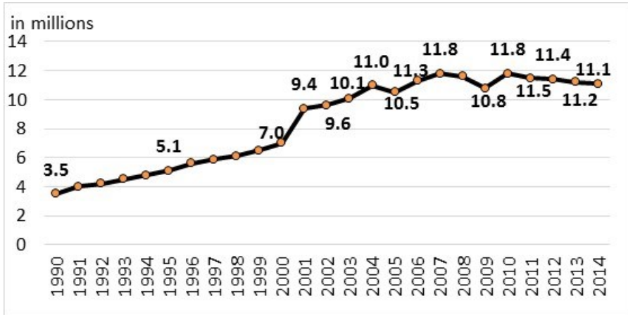
Figure 1. Unauthorized Foreigners in the US, 1990-2014