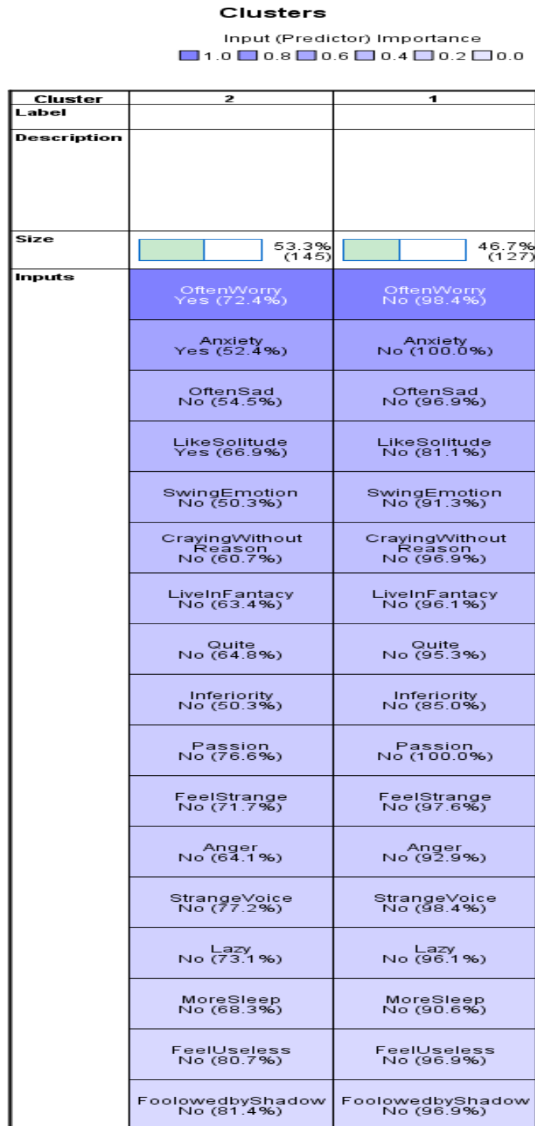
Figure 1 Two Step Clustering

From the results of Two Step Clustering, it was found that respondents could be grouped into 2 groups based on their mental health symptoms. From the results, Group 1 will be called the group with high mental health and group 2 will be called the group with low mental health.