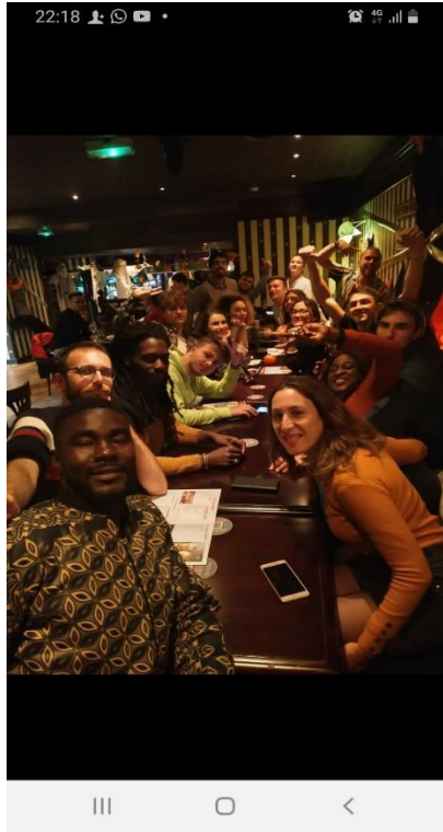
Figure 2: Erasmus Project dinner (J. Senegal)