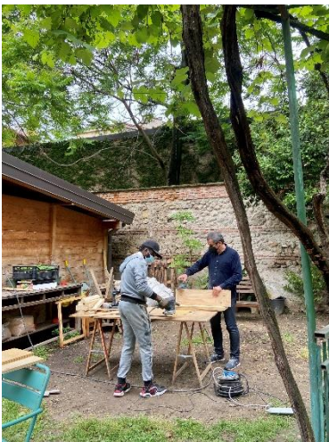
Figure 5: Collaboration (E., Italy)

The fourth theme identified from the participants' photos and comments has to do with nostalgia as a dominant feeling in migrants' lives. The lack of certain affections left behind in the country of origin, the cultural and environmental differences encountered in the new context can lead to the emergence of feelings of sadness and melancholy. A participant, arriving from an African village, recounts having found a tree in a park in Milan that resembles those found in his village and photographs it as an emblem of nostalgia for his country, as Figure 6 shows: "The tree in the park in Milan, that resembles the mango in the Jorren village" (S., Gambia).