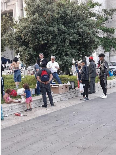
Figure 4: Distribution of basic goods by volunteers at the Central Station of Milan (A., Senegal)