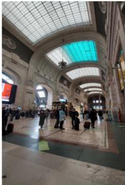
Figure 3: Central Station of Milan (F., Italy)

The third theme identified by the participants is “solidarity as a universal gesture” that can unite different cultures. Collaboration and solidarity are the ingredients for building fairer, multicultural societies. Migrants and Italians together commit to helping those in most need, providing clothes, food or working together to make places more livable. A participant said: “I think everyone can do their part, we are not all in the same situation but everyone can get active and help” (A., Senegal). Figures 4 and 5 depict moments of collaboration and solidarity for people in need carried out by migrants and Italians.