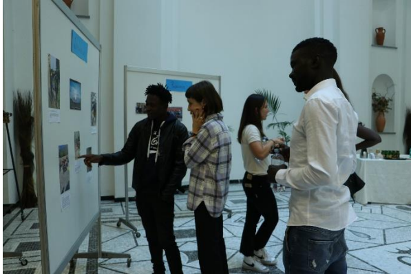
Figure 7: The photovoice participants who took part in the final photographic exhibition with the role of "guides".

At the end of the process, the group of participants organized a photographic exhibition displaying the 20 photos selected and commented on by the group. The exhibition was set up in the atrium in one of the premises of the Catholic University of Milan at the end of a workshop involving other young students and young migrants. Figure 7 shows the photovoice participants who took part in the exhibition with the role of "guides", explaining to visitors the path taken and the meaning of the photos on display.