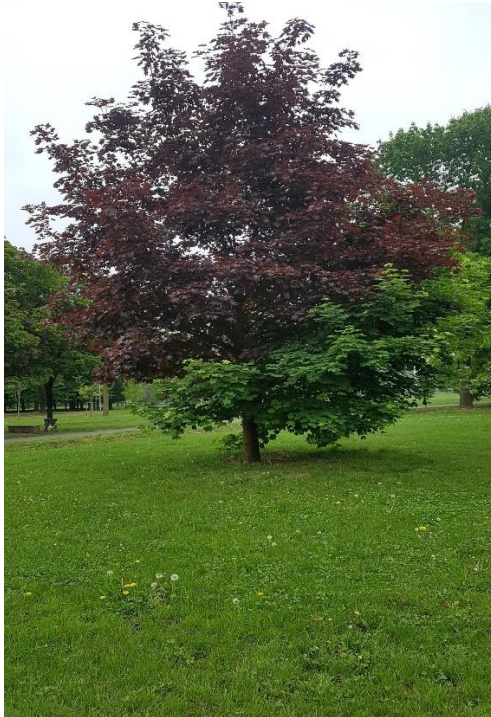
Figure 6: Jorren tree (S., Gambia).

A final theme related to non-integration is the economic poverty in which many migrants find themselves. Their poverty is relational and affective and implies the lack of stable ties. Isolation and loneliness are in fact, the other side of the coin of poverty.