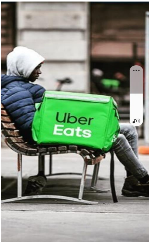
Figure 7: Life as a rider (A., Senegal)

An example is Figure 6, which shows a rider sitting alone on a bench with a decidedly sad countenance.