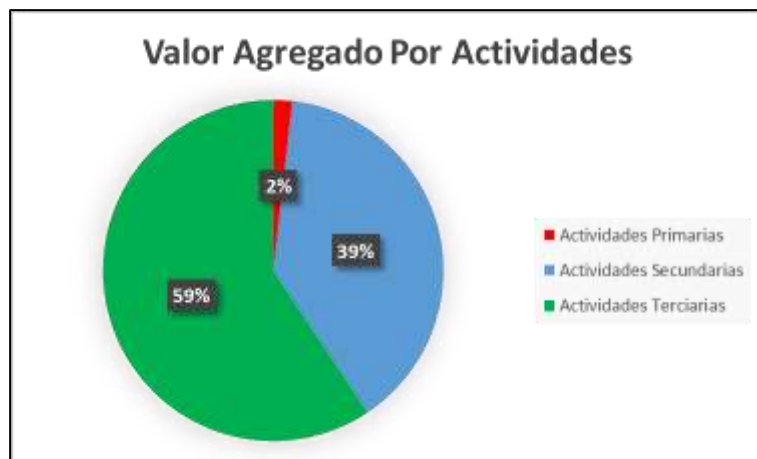
Figure 5. Value added by economic activities