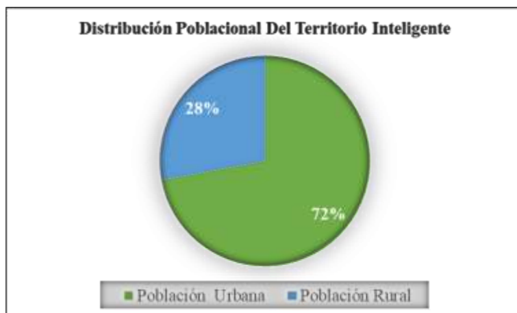
Figure 4. Population distribution of the Intelligent Territory

The degree of urbanization of the territory is 77.41%, noting that of the 6 municipalities the only municipality with more than 50% of the population located in the urban area is Sogamoso with 92.82% and the municipality with the highest rural population is tota with 95.47% of its inhabitants, (taking as a basis the population adjusted by coverage census in 2018 which is 7% of the total population) so it is evident that the degree of urbanization is so high thanks to the fact that the majority of the population is located in the municipality of Sogamoso.