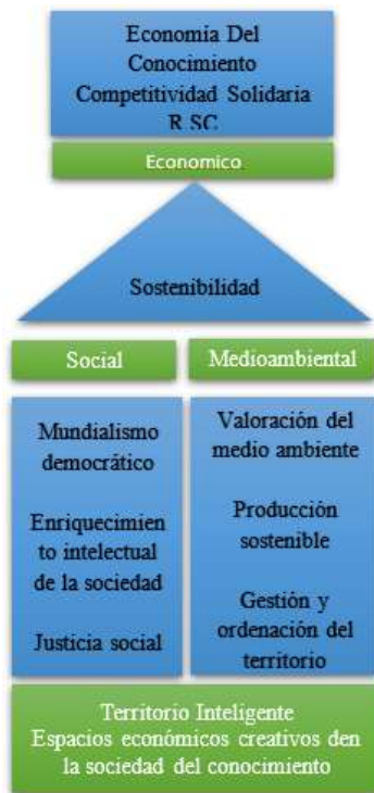
Figure 2. Triangle of economic, social, and environmental sustainability.

In conclusion, a territory is economically sustainable when its competitiveness is determined by innovation, appropriation, knowledge diffusion, creativity, and the talent of its citizens, which allows competitive advantages at a global level. It is important to clarify that any city or municipality, regardless of its size and level of infrastructure, can be a smart territory.